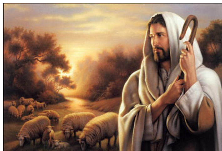
The Lord is my shepherd; there is nothing I shall want.

Thank You so very much for coming to me, right now, and for being my strength and my hope always: after journeying through life, I long to live with You in peace forever in heaven. Amen